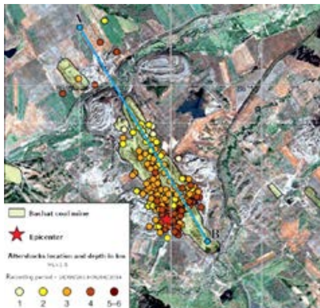
Fig. 1. The Bachat earthquake epicenter

The seismic situation in local mining regions. Microseismic monitoring systems are currently being designed to analyze and monitor the specific region of the mine. The Bachat earthquake that occurred on June 18, 2013 in the Kemerovo region (Russia) with a local magnitude ML = 6.1 is the world's strongest man-made earthquakes associated with mining operations during the development of the coal (Fig. 1). The maximum observed intensity of shaking was I = 7 points. The earthquake was accompanied by an intense aftershock process. Bachatsky coal mine, laid in 1948, - one of the largest coal mine in Russia, its dimensions are 10 km in length, 2.2 km in width and 320 m in depth (at the time of the Bachat earthquake). The average annual coal production is more than 9 million tons. Coal production in this open pit continues and the planned depth of the open pit is \sim 550 m. The results of these studies presented in (Emanov A.A. et.al, 2020), such as the spatial coincidence with the coal-mining area, the pulsating nature of activation, the mechanism of the main shock, indicate the technogenic nature of the Bachat earthquake. Also this paper presents the results of the last years of observation, the time series and the history of seismicity in mining area.